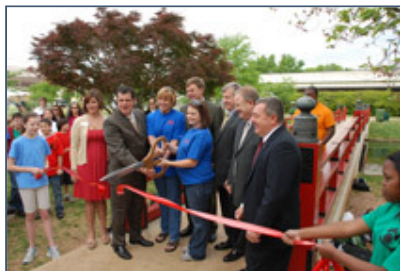
Panoply Ribbon Cutting Big Spring Park at the Japanese Bridge April 22

Ribbon Cutting Ceremonies are a great way to introduce your business! Take advantage of this free service provided by the Chamber of Commerce for its members.